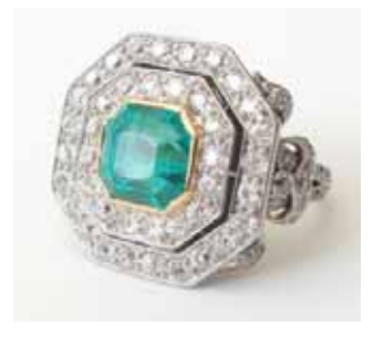
Glittering octagonal emerald and diamond ring, from the 1960s, from Plaza.

Nouveau diamond and ruby pendants, moonstone rings, and gold and platinum and diamond earrings and bracelets. Among the many unusual items will be an Edwardian Suffragette necklace with amethyst, peridot and tourmaline dated circa 1910.